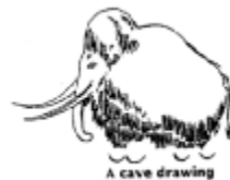
A cave drawing

In this display, you see the teeth and portion of a leg bone of a woolly mammoth, an animal that lived about 26 million years ago and became extinct about 10,000 years ago at the end of the last ice age. Look at the bones (collected in Mississippi) and drawings and answer the following questions.