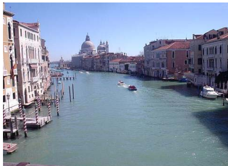
Venice, Italy in March 2006

Applications will be released on November 27, 2006. Those who receive the scholarship will be able to use it for programs in Fall