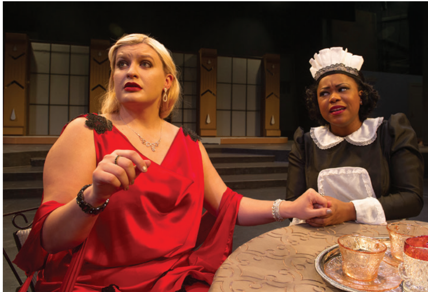
Students in the Southern Miss Theatre department perform By The Way, Meet Vera Stark

The University participates in the master lease/purchase program, which is a centralized program maintained by the IHL Board office of the Mississippi Institutions of Higher Learning in which the universities' essential governmental-use equipment needs are consolidated into and financed as one request. This consolidation means the cost of issuance is lower, and the institutions collectively receive a better interest rate than they would have received individually. Lease terms for equipment purchased through the master lease/purchase program cover a period not to exceed five years. The University has the option to prepay all outstanding payments less any unearned interest to fully satisfy the obligation. There is also a fiscal funding addendum stating that if funds are not appropriated for periodic payment for any future fiscal period, the lessee will not be obligated to pay the remainder of the total payments due beyond the end of the current fiscal period.