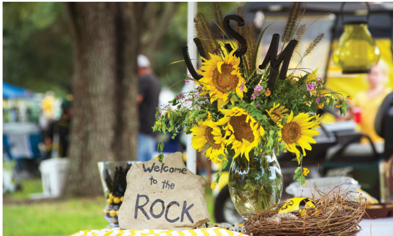
Fans show their school spirit through Tailgating displays at The District.

Generally speaking, operating revenues are received for providing goods and services to the various customers and constituencies of the University. Operating expenses are those expenses paid to acquire or produce the goods or services provided in return for the operating revenues and to carry out the mission of the University. Non-operating revenues are revenues received for which goods and services are not provided. For example, state educational appropriations are non-operating because they are provided to the University without the state legislature directly receiving commensurate goods and services in return for those revenues. Non-operating revenues also include private gifts for other than capital purposes, federal financial aid, investment income, net unrealized appreciation or depreciation on the fair value of investments and interest expense.