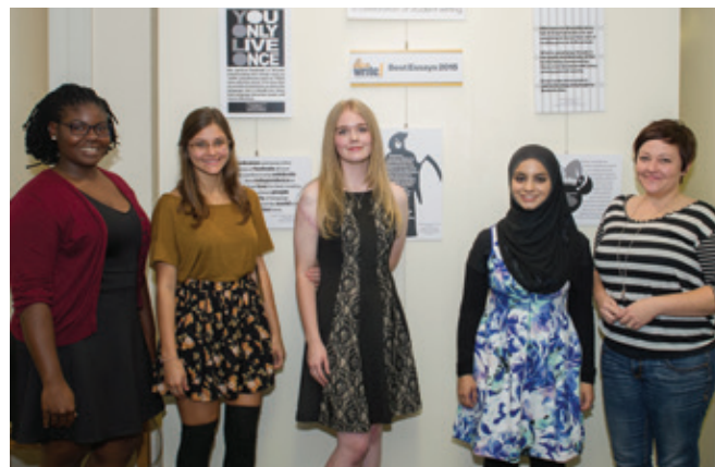
Winners of this year's Eagles Write! celebration..

The collateral for public entities' deposits in financial institutions is now held in the name of the State Treasurer under a program established by the Mississippi State Legislature and is governed by Section 27-105-5 of the Mississippi Code Annotated (1972). Under this program, the universities' funds are protected through a collateral pool administered by the State Treasurer. Financial institutions holding deposits of public funds must pledge securities as collateral against these deposits. In the event of failure of a financial institution, securities pledged by that institution would be liquidated by the State Treasurer to replace the public deposits not covered by the FDIC.