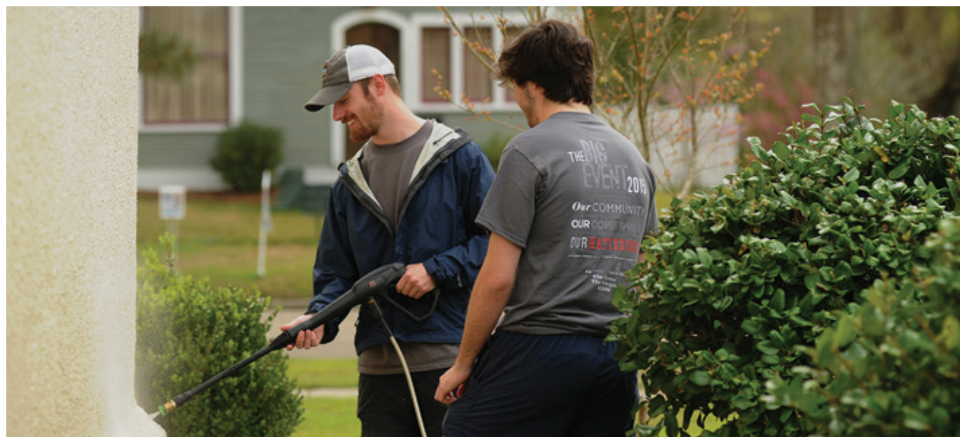
Students help clean up during the 2015 Big Event, a university-wide day of service.

In addition to their natural classification, operating expenses are also reported by their functional classification as defined by the National Association of College and University Business Officers (NACUBO). The functional classification of an operating expense is assigned to a department based on the nature of the activity, which represents the material portion of the activity attributable to the department. This method reflects amounts expended in areas such as instruction, research, and operations and maintenance, and is used most commonly for comparative reporting purposes among colleges and universities.