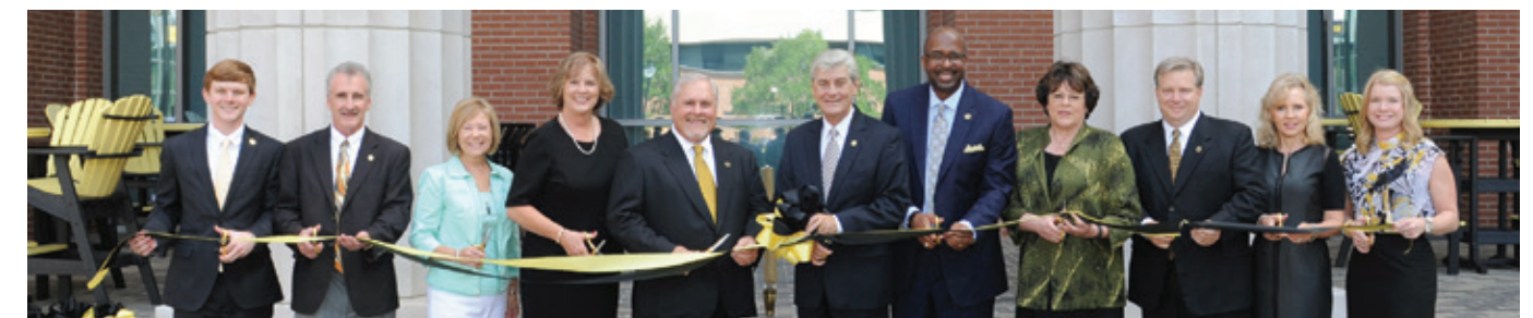
A ribbon-cutting ceremony for Scianna Hall, new home to the College of Business on the Hattiesburg campus, was held September 4, 2015.

All amounts are considered current and will be fully recognized within one year.