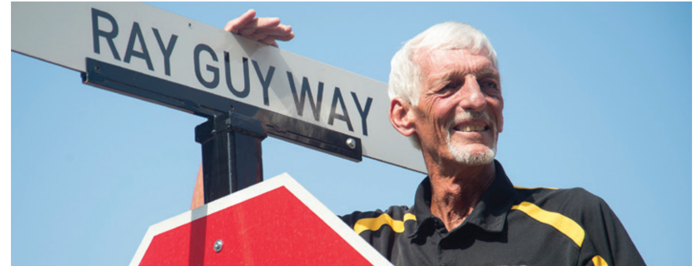
A campus street was dedicated to Ray Guy in honor of his induction in to the Pro Football Hall of Fame.

As a public institution, the University relies heavily upon appropriations from the State of Mississippi to operate. The economic position of the University is directly related to that of the State of Mississippi, as approximately 43% of the University’s budgeted educational and general fund revenue comes from state appropriations.