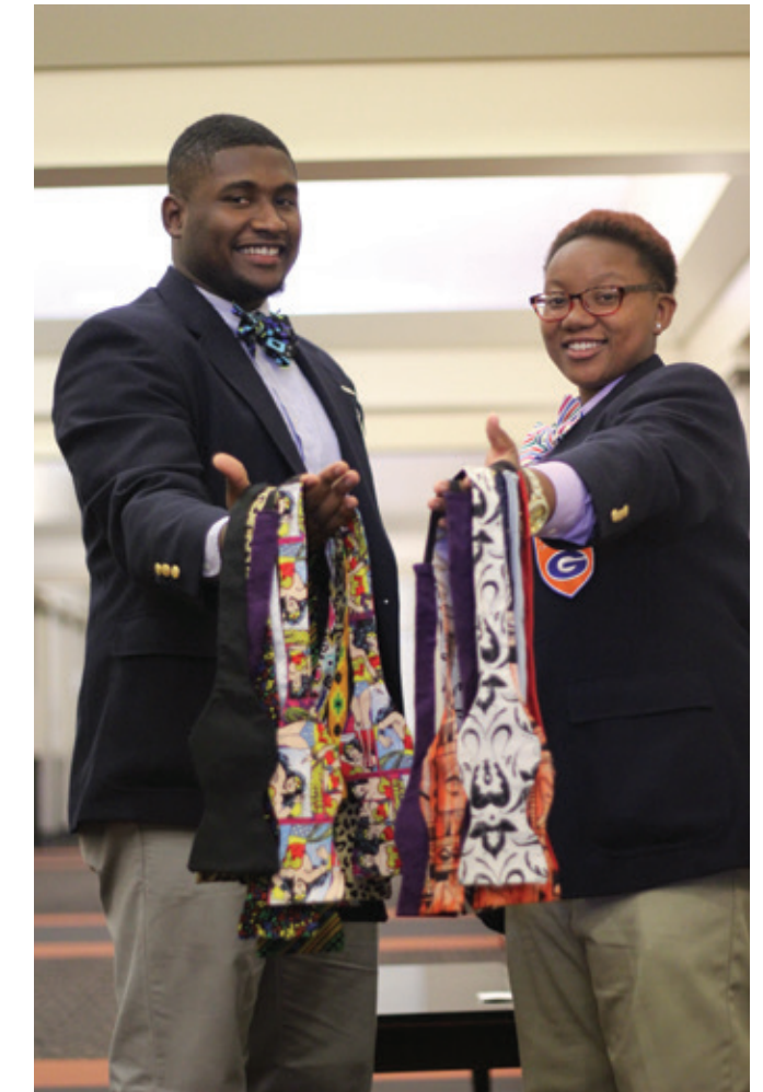
College of Business students compete at the spring Southern Entrepreneurship Program.

S.M. Educational Building Corporation issued revenue notes (Series 2007) in December 2007 to provide funds for the construction of the stadium scoreboard on the Hattiesburg campus. The original issuance was $3,160,000 payable semi-annually with a fixed interest rate of 6.29%. On August 27, 2013, a First Amendment to the Indenture was executed, reducing the interest rate to a fixed rate of 1.29% on the remainder of payments due from March 1, 2014, to September 1, 2017. This note is scheduled to be retired in September 2017.