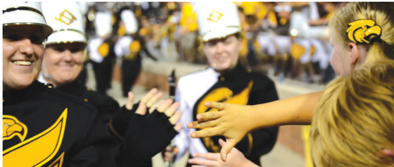
Members of The Pride of Mississippi Marching Band greet their fans during a football game.