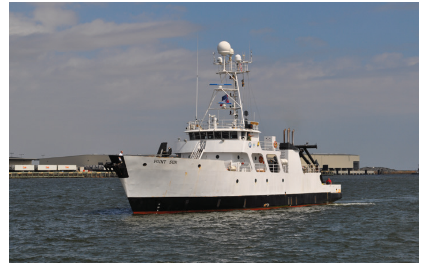
The University's newest research vessel, Point Sur , arrives at the Port of Gulfport.

The overall net use of cash for operating activities increased. This was principally due to a decrease in net tuition and fees revenue and increases in payments to employees and vendors. This decrease was somewhat offset by the reclassification of revenue for athletics and food services previously discussed in this narrative.