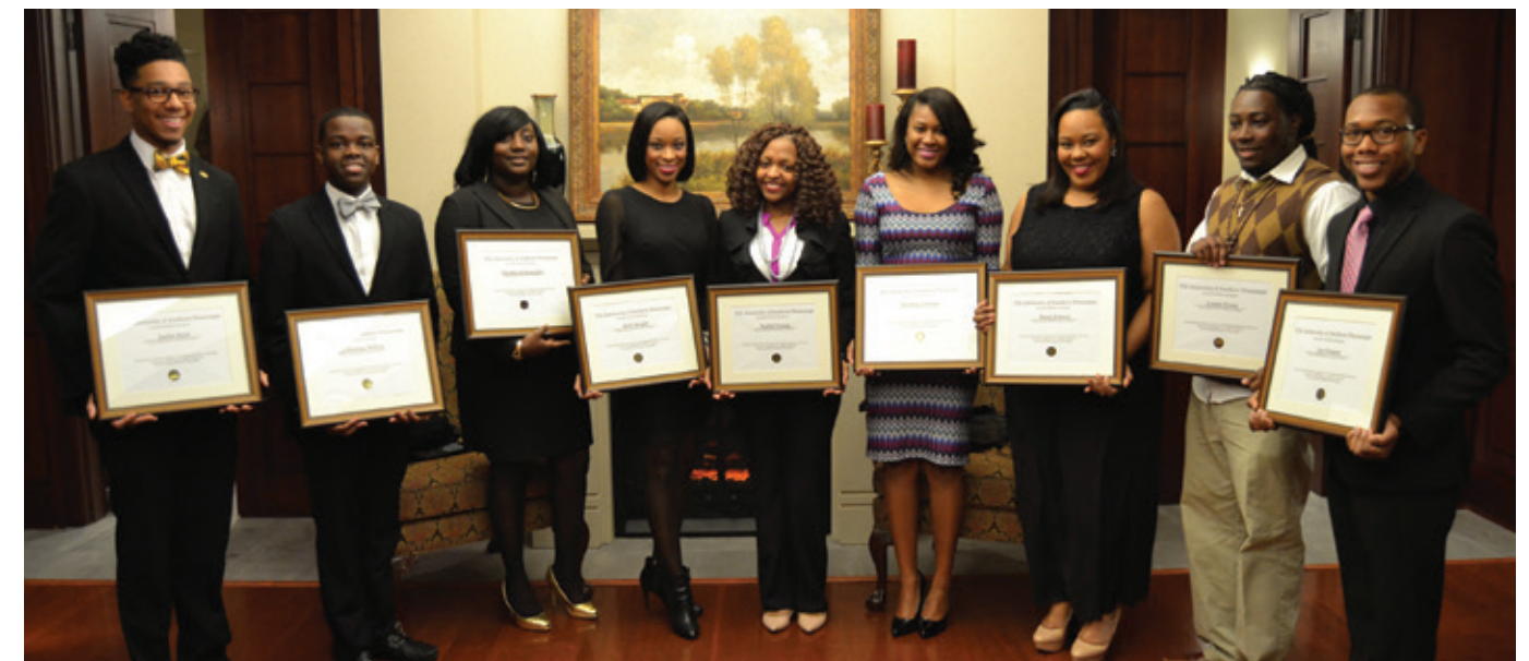
Members of the inaugural cohort of the Kennard Scholars Program

State financial support for the University continues to decline as a percent of our total revenue, while fixed costs of operations continue to rise. In an effort to offset increased operational costs, a 3.5% tuition rate increase was requested by the University and approved by the Institutions of Higher Learning (IHL) Board. This rate increase went into effect for the fall 2015 semester. A direct relationship exists between the growth of state support and the University’s ability to control tuition growth as declines in state appropriations affect tuition levels. A crucial element to the University’s future will continue to be our relationship with the State of Mississippi as we work to maintain competitive tuition while providing an outstanding college education to our students.