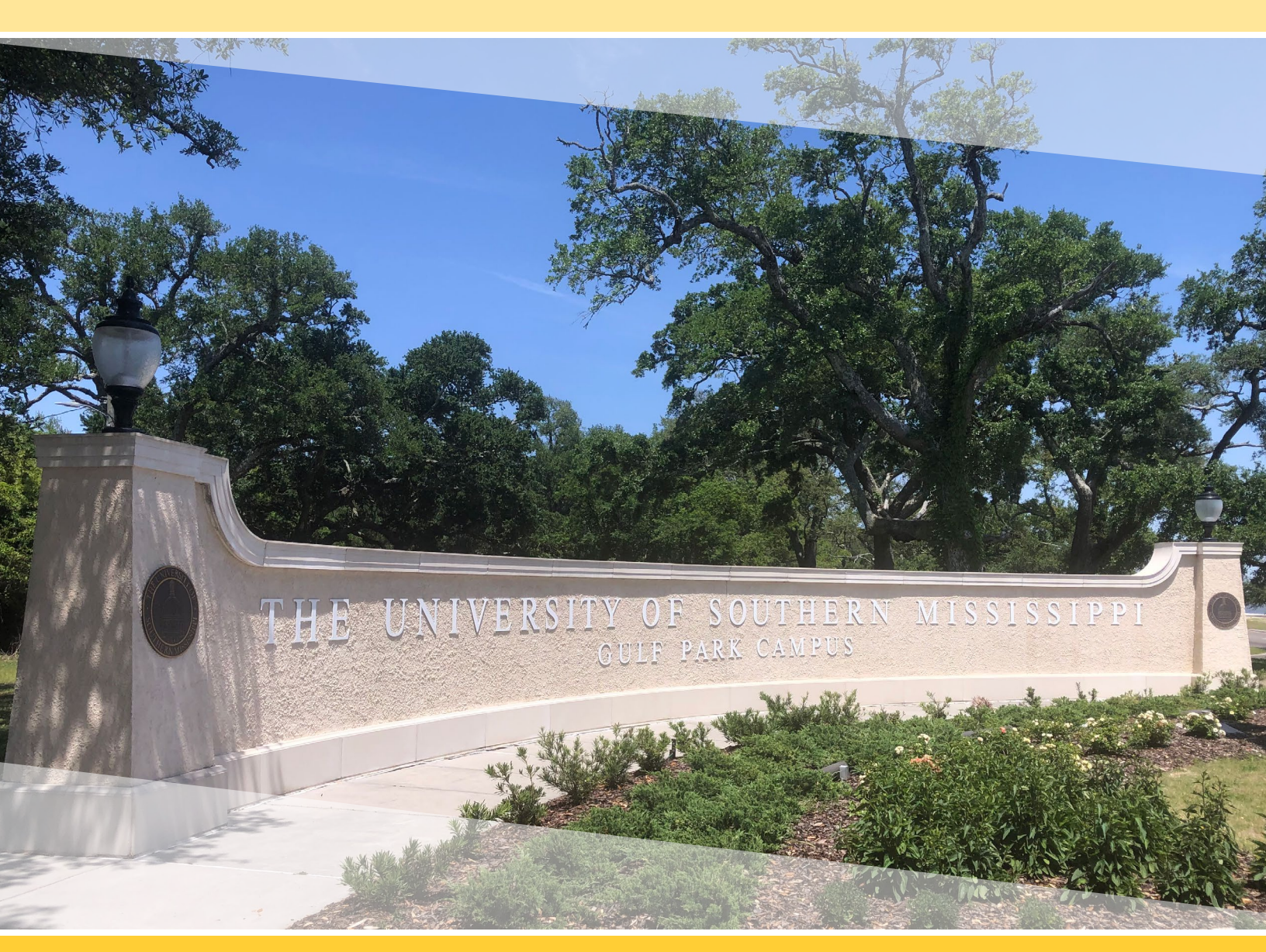
Maintaining a Safe and Secure Campus Environment