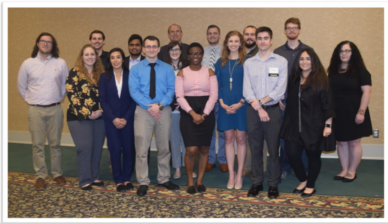
Winners of the Oral and Poster Presentation Prizes at the 2018 Graduate Student Research Symposium

Nearly 100 graduate students showcased their original research by giving oral or poster presentations on Thursday, March 26 during the annual Susan A. Siltanen Graduate Research Symposium. Students competed for best oral presentation and best poster prizes in four categories: Arts and Humanities; Life, Health, and Environmental Sciences; Physical Sciences and Mathematics; and Social and Educational Sciences and