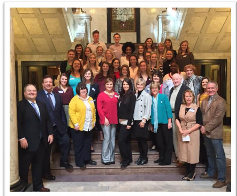
Faculty and students from the Department of Speech and Hearing Sciences at the Mississippi Capitol.

The Family Nurse Practitioner, Psychiatric Mental Health Nurse Practitioner, and associated post-master's certificate online graduate degree programs received the top ranking in Mississippi and were ranked 57 th of 100 nationally by the U.S. News and World Report Online Graduate Nursing Program Rankings for 2017. The rankings are based on