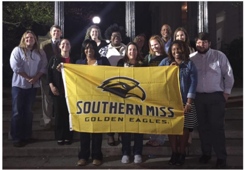
Faculty, graduate students, and a USM alumnus attended the Southern History of Education Society conference earlier this month